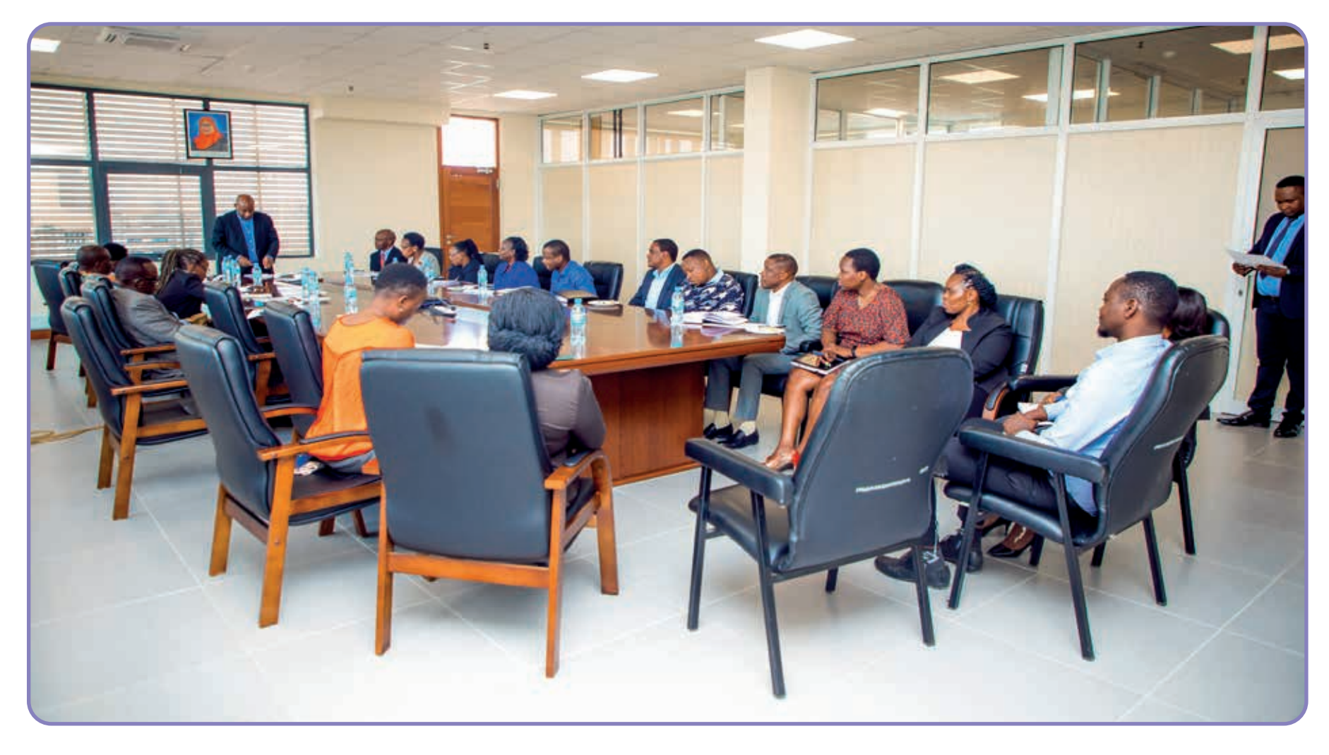
PPAA Members, Management and staff at the introductory meeting held on 14 November 2022, in the Appeals Authority's office in Dodoma