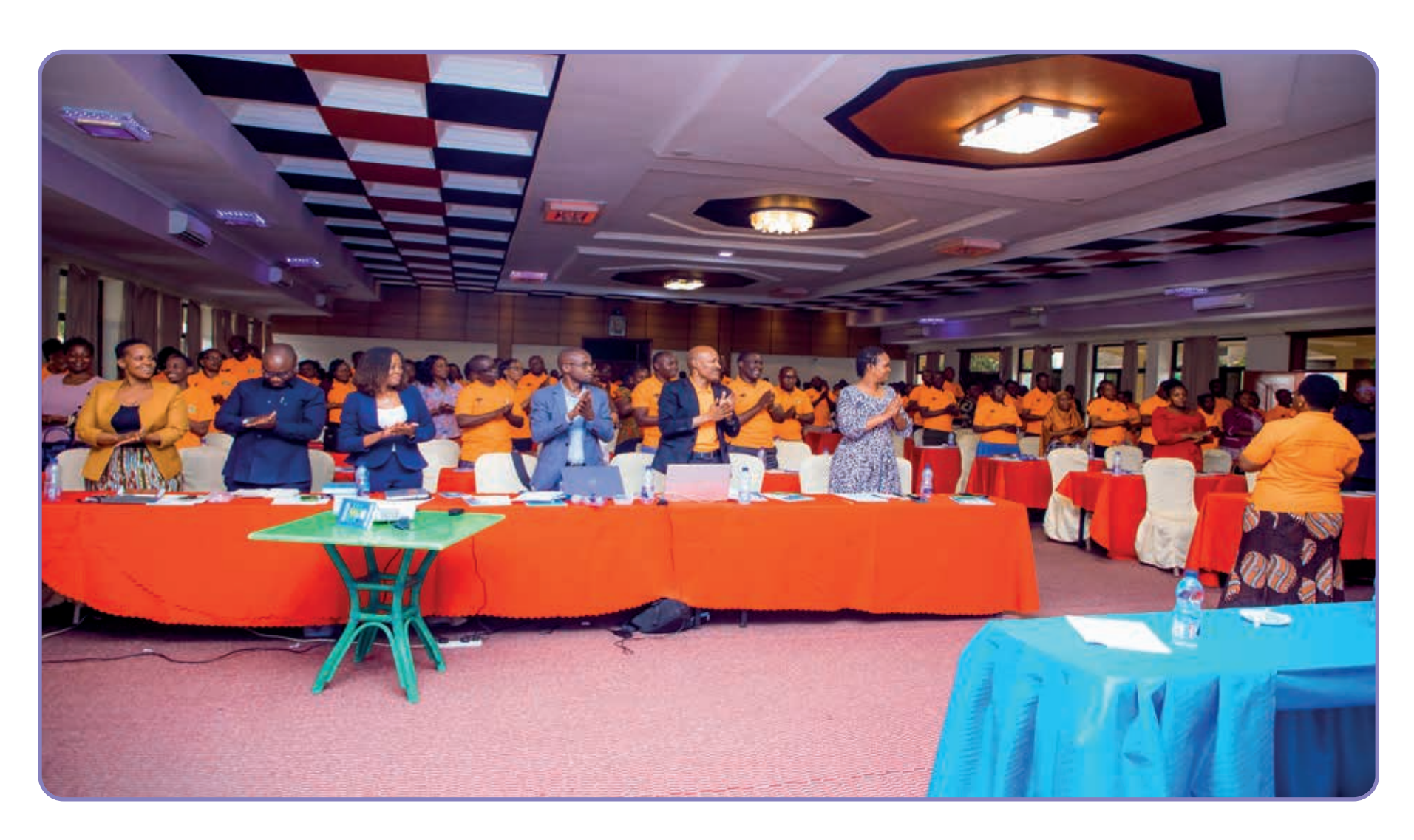
Participants at a community development officers retreat which was held in Dodoma recently